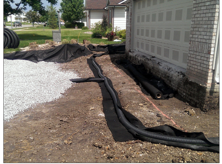
Step 2 Installation of perforated subdrain tile