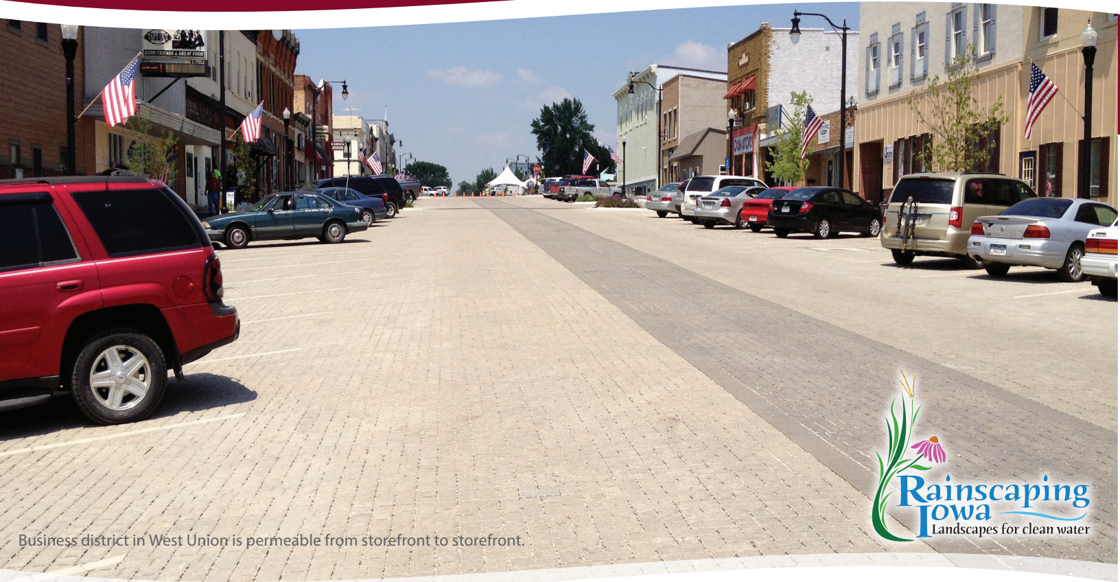
Business district in West Union is permeable from storefront to storefront.