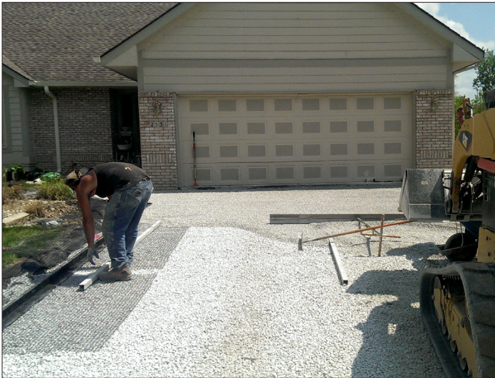
Step 3 Leveling and compacting aggregate