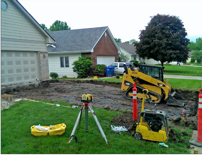
Step 1 Removal of concrete and excavation