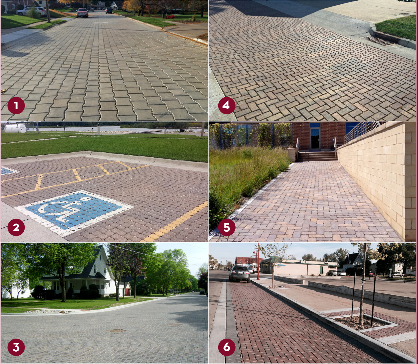
1 Davenport - Residential Street