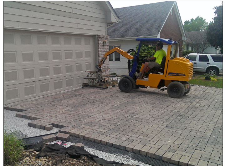
Step 4 Laying pavers