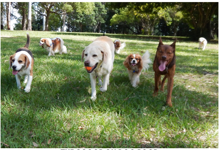
THE SCOOP ON DOG POOP

Not the most glamorous subject to think about, however, when it comes to protecting the water quality of our streams and lakes it's worthy of discussion. So what's the harm in a little poop left behind every once in a while? It turns out it's a bigger problem than most people think. In a recent water quality study in the Indian Creek Watershed in Linn County, it didn't matter if it was a small storm, a large storm or a few days of constant showers there was evidence of fecal pollution in water samples collected from local streams. Concentrations of these bacteria were found in quantities that are deemed unsafe for human contact.