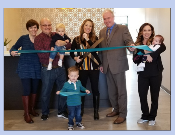
Hope Hearing & Tinnitus Center Ribbon Cutting 1727 Boyson Road, Hiawatha